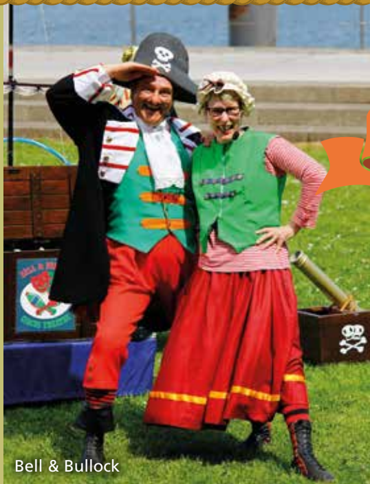
Bell & Bullock