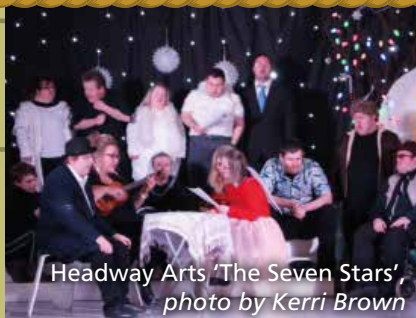
Headway Arts 'The Seven Stars'