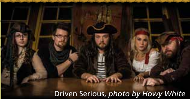
Driven Serious